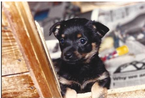
Hesta as a puppy