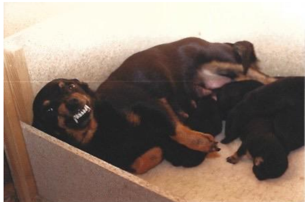
Hilda's and her litter